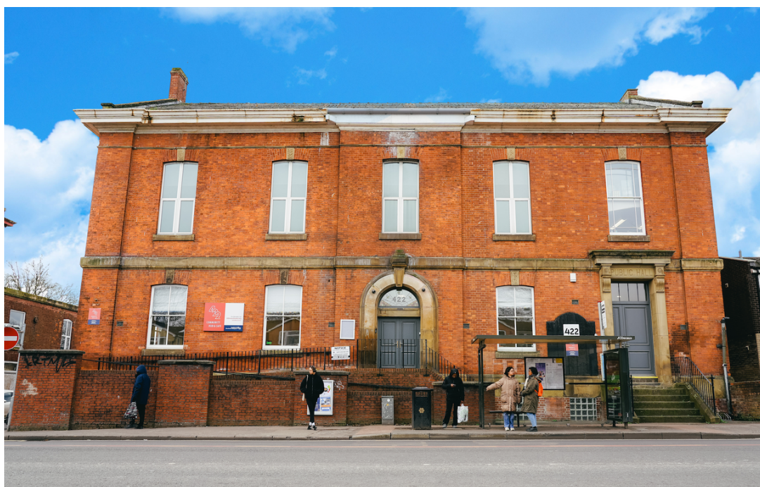
422 building front, photo by 422 Community Hub

Personal knowledge of the area is not a requirement but dedicating time to learn more about our neighbourhood and its people in order to develop your project would be strongly advised.