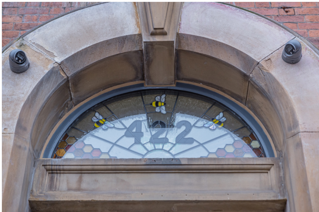
422 building front detail

422 Arts is commissioning a new building front installation to mark the recently completed restoration of our building and invites artists to express their interest in this unique opportunity. If you are a socially minded artist who already has some experience in creating public art commissions or outdoor installations, and you are passionate about working with local communities in a site-specific context – we would love to hear from you by Sunday 2 July 2023 at 23:59 .