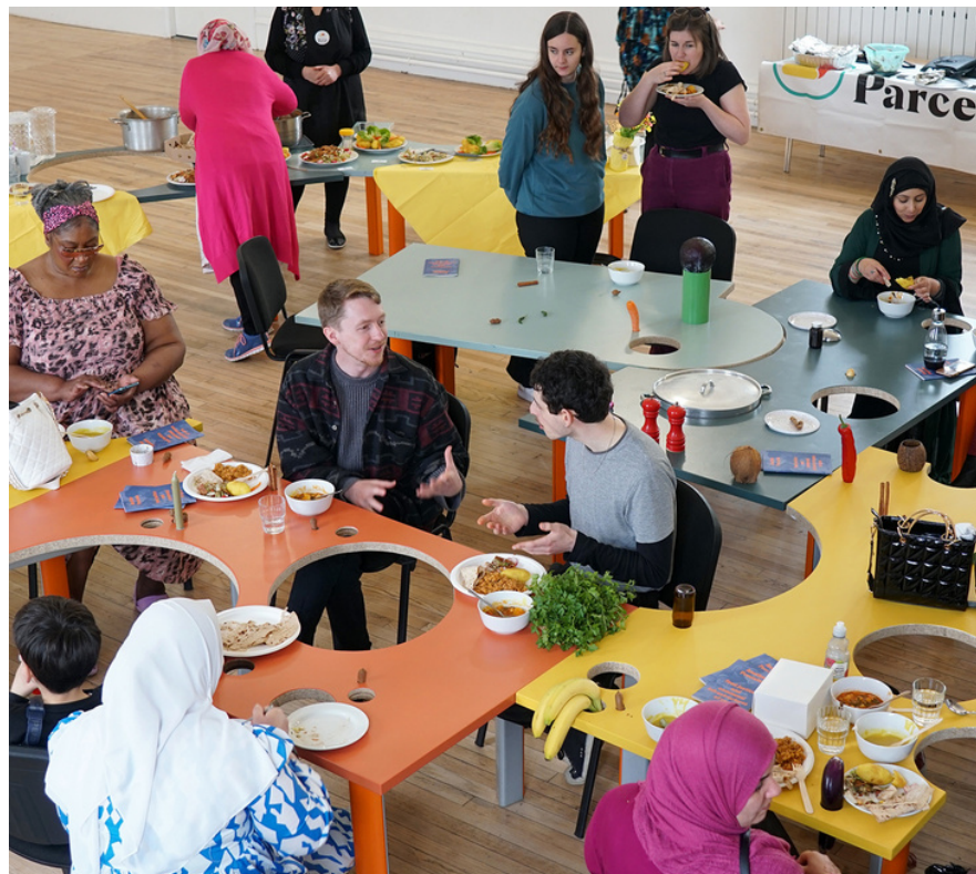
422 Arts public event, 2023

422 Arts is a Manchester-based arts organisation established in collaboration with 422 Community Hub . Our projects utilise creative practices to tackle social problems and respond to the needs and interests of our neighbourhood and its people. We aim to serve the local communities of Longsight and Ardwick and the broader arts sector by delivering artist commissions, events and workshops that are accessible, engaging, and diverse.