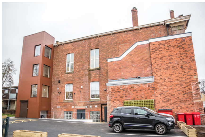
422 building back

422 Arts operates in a beautifully restored Victorian building located in one of Manchester's most ethnically diverse areas. Our building has gone through various phases since it first opened to the public in 1851 as one of the first free public libraries in the UK. In the 80s and 90s, it was better known as the Longsight Youth Centre, followed by over a decade-long closure before reopening in 2021 as the 422 Community Hub. Stockport Road is one of the city's busiest transportation arteries connecting south Manchester to the city centre, meaning that our commission will be seen by over 20k people every day . In 2023, renovation works were finally completed and 422 is now fully accessible and provides home to multiple non-profit organisations and community wellbeing initiatives.